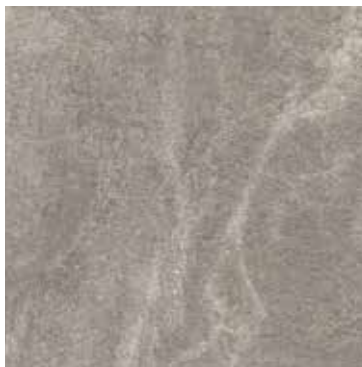
DARK GREIGE B43800