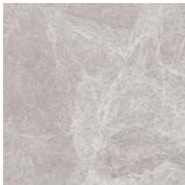
LIGHT GREY B43799